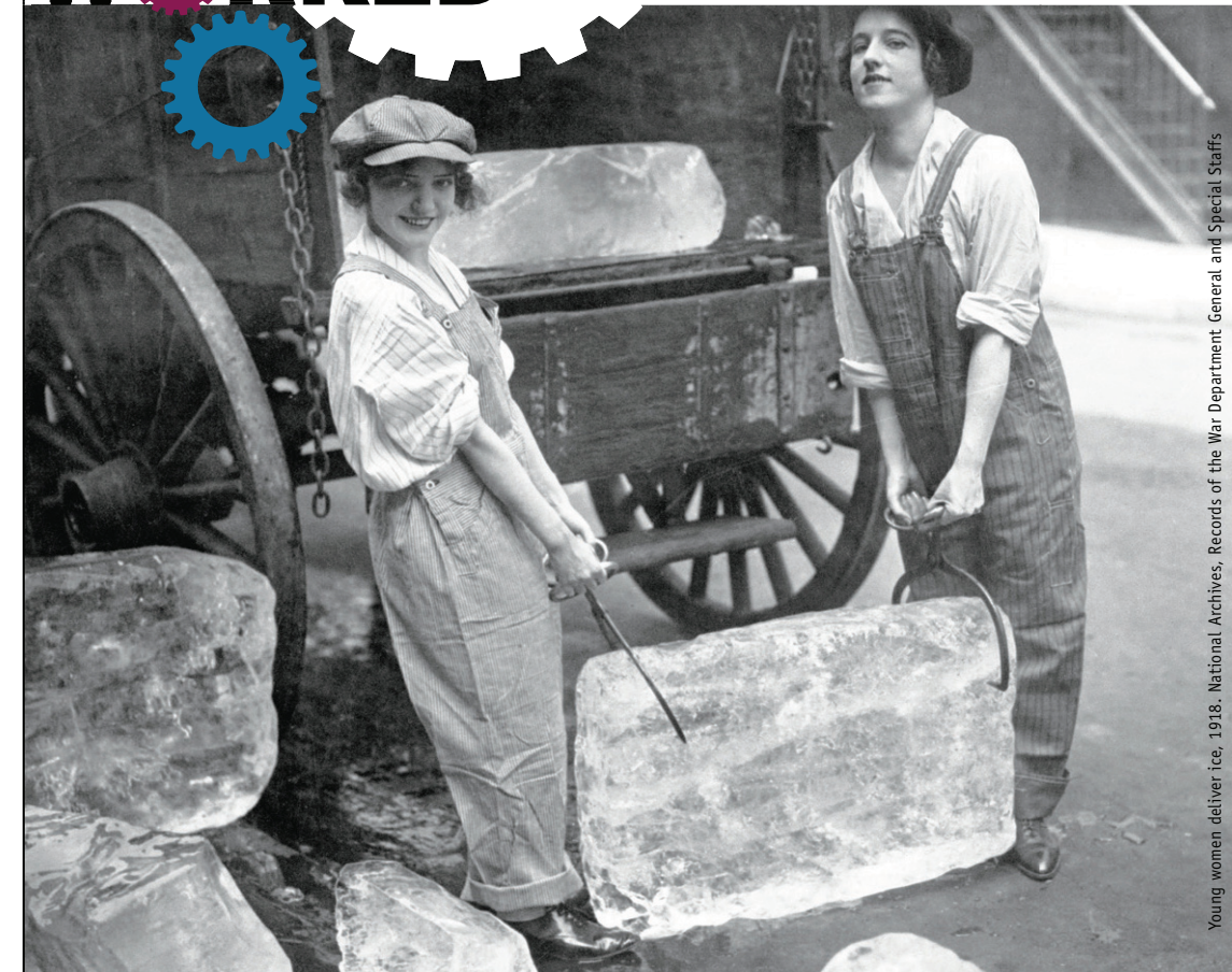
Young women deliver ice, 1918. National Archives, Records of the War Department, General and Special Staffs